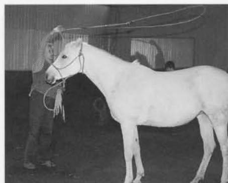
Introducing a loop from the ground.