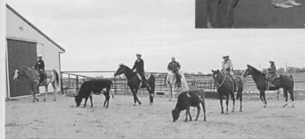
Drivin' 'em to the barn.