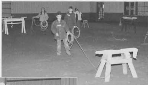
Takin' shots at the dummy.